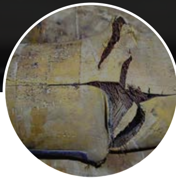
Excessive Cover Damage